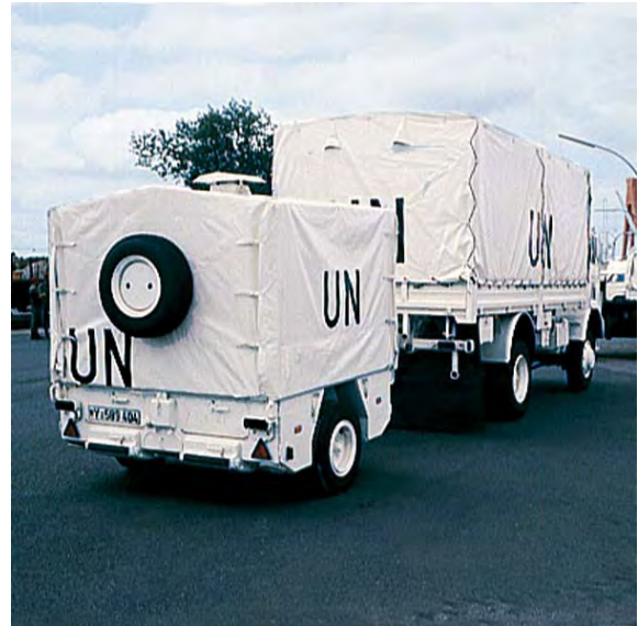
The trailer is fitted with the following equipment: