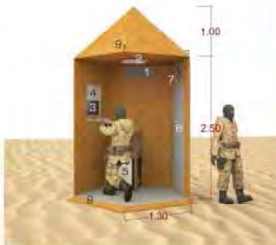
interior perspective [front view]