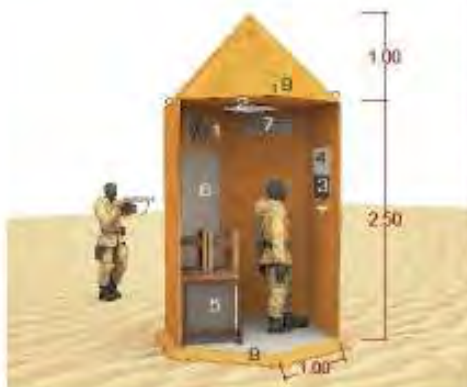
interior perspective [front view]